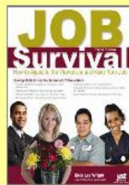
Job Survival workbook