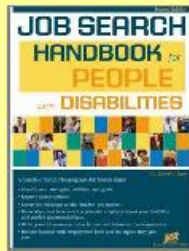
Job Search Handbook for People with Disabilities