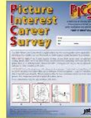
Picture Interest Career Survey