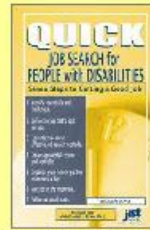
Quick Job Search for Ex-Offenders booklet