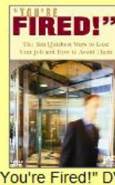
"You're Fired!" DVD