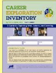
Career Exploration Inventory